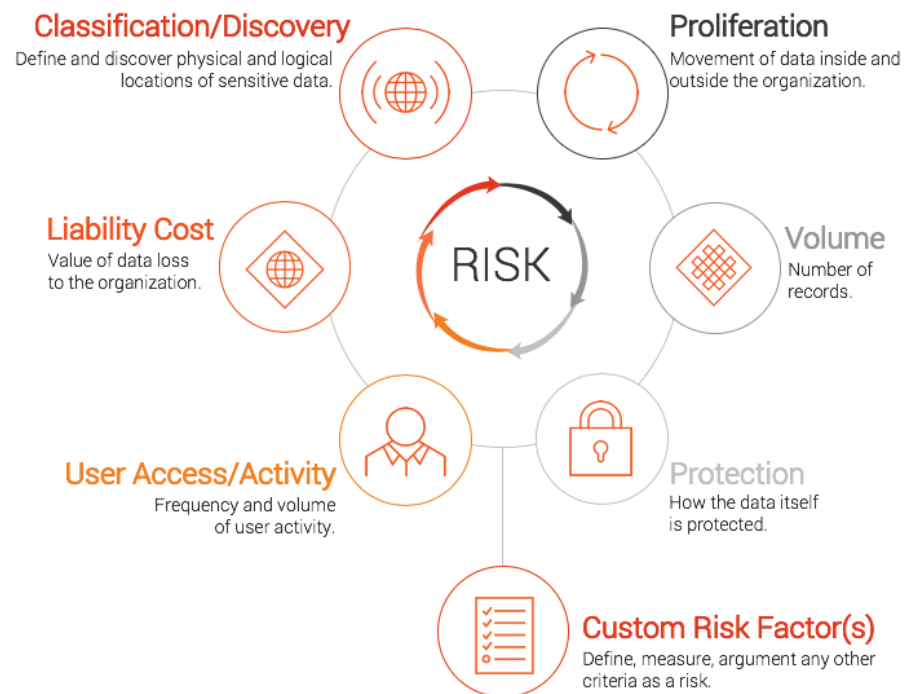
Figure 2: Risk analytics achieve highest accuracy when a solution can continuously discover and classify sensitive data and where it proliferates, scale for data growth, apply protection methods at the data level, incorporate custom risk criteria, monitor and track user behavior, and generate estimated costs of data loss.